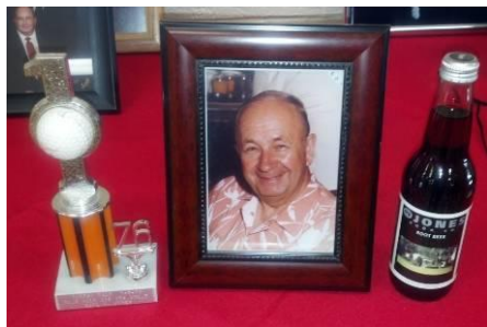
Maybe a golfer can explain this to you (1976 Forest Dale)